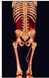
Images obtained from the TOSHIBA Aquilion Multislice CT scanner and the Vitrea Workstation.